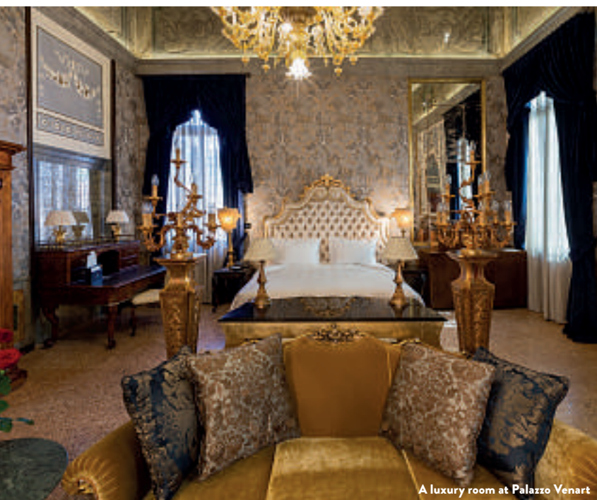
A luxury room at Palazzo Venart