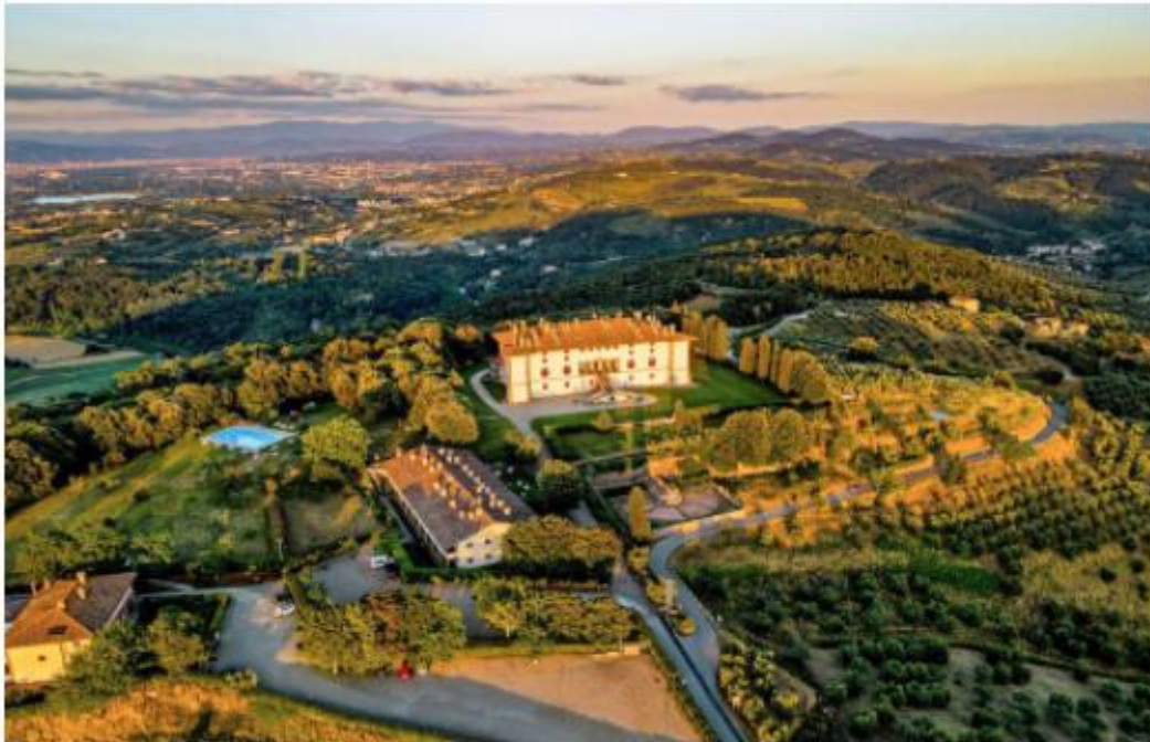
Aerial view of Tenuta Di Artimino

Tenuta di Artimino is set in the hills and vineyards of Montalbano, once home to an Etruscan settlement. The property includes an ancient villa (Villa dei Cento Camini) that was designated as a UNESCO World Heritage Site in 2013.