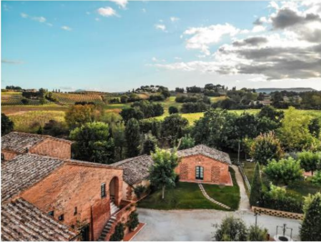
A countryside setting in Tuscan wine country BORGO SAN VICENZO

The 21 studios and suites in this restored 18th-century farmhouse offer a fresh take on traditional Tuscan design, each one uniquely curated based on its location and architecture. The studios all offer king-sized beds, sitting areas, and kitchenettes with Italian linens, Nespresso coffee makers, Acqua dell-Elba toiletries, and complimentary Wi-Fi.