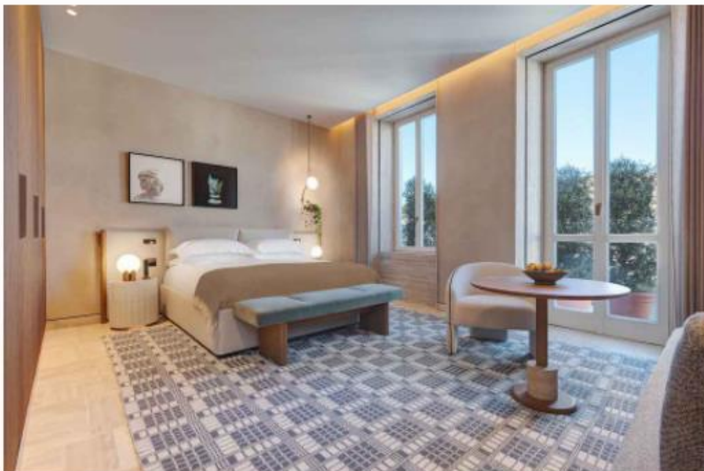
One bedroom unit at Six Sense Rome SIX SENSES ROME

This restored UNESCO-listed, 18th-century, Rococo-style Palazzo Salviati Cesi Mellini once served as a residence for cardinals of the Catholic Church. Its main facade and central staircase have been painstakingly preserved and the building will now house 95 distinctive high-ceiling rooms and suites, a restaurant, and a rooftop terrace with 360° city views.