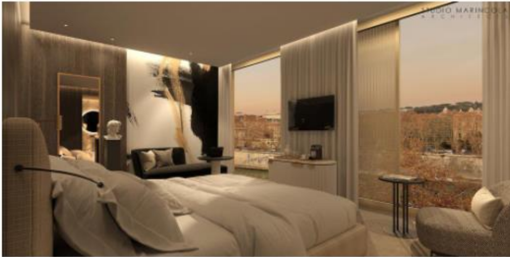
Guest room with a city view THE PAVILIONS ROME, THE FIRST MUSICA

The hotel will be offering immersive experiences, including food-themed ones with food tours, cooking experiences, and fine dining as well as family-oriented ones rich in culture and history.