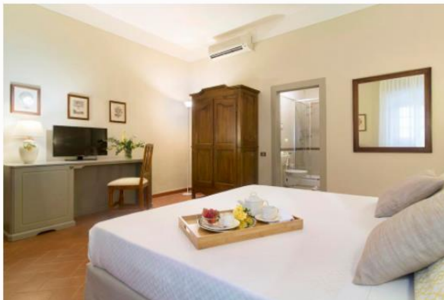
Relaxing guest room at Tenuta Di Artimino

Part of the Melia Collection of Melia Hotels International , 36 guest rooms sit in a 17th-century building, Paggeria Medicea, along with a group of 59 lodges dotting the medieval village, each with an independent entrance. The units are designed in Tuscan Renaissance style with terracotta floors, wooden beams, and local s