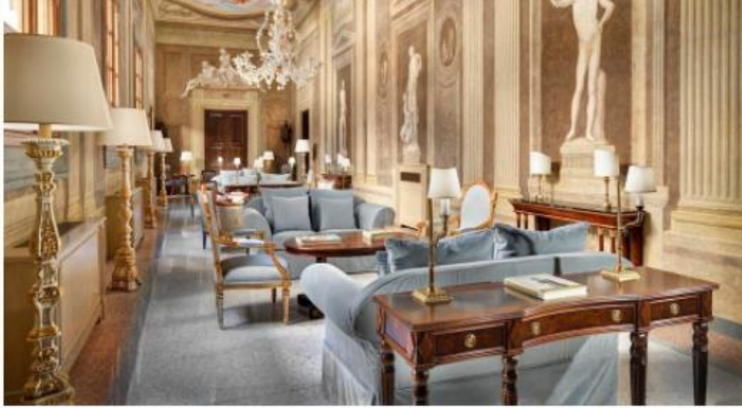
The Gallery at Palazzo Portinari Salviati

Palazzo Portinari Salviati is located in the heart of the historic center of Florence, between Piazza del Duomo and Piazza Signoria. This magnificent Florentine palace was built in the 15th-century by the Portinaris, a wealthy family with ties to the Medicis.