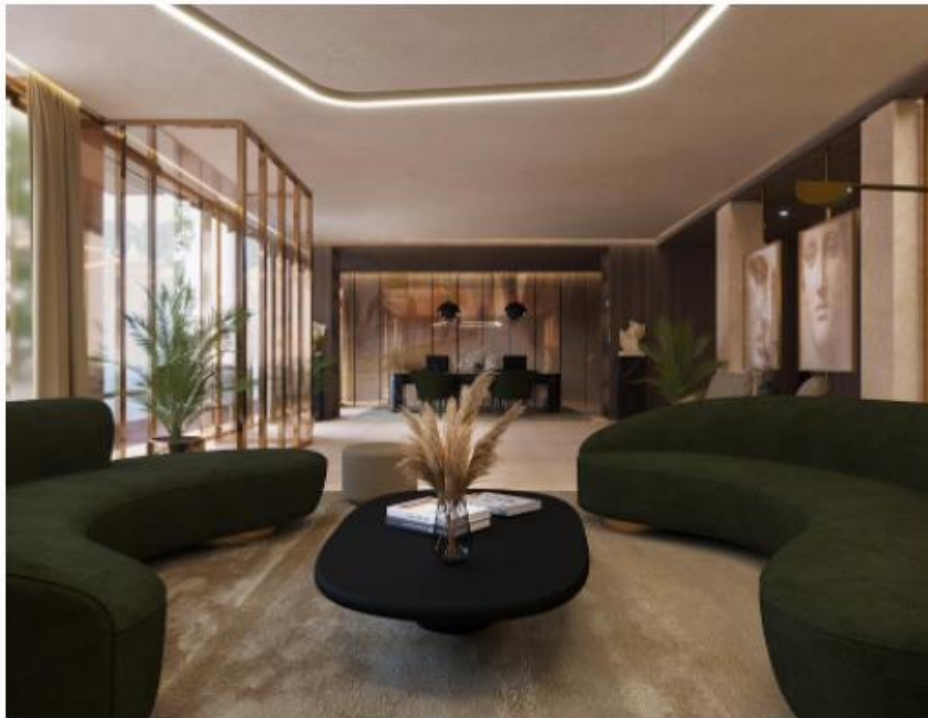
An inviting common area at the hotel THE PAVILIONS ROME, THE FIRST MUSICA

This contemporary, five-star wellness hotel is located along the banks of the Tiber River offering breathtaking views of the historic center of Rome. Located close to the designer shops in Rome's exclusive Prati neighborhood, guests staying at The First Musica can walk to The Spanish Steps and to St. Peter's Basilica at the Vatican.