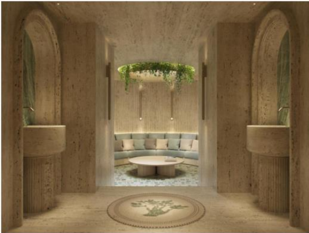
Entrance to the Six Senses Spa SIX SENSES ROME

This restored UNESCO-listed, 18th-century, Rococo-style Palazzo Salviati Cesi Mellini once served as a residence for cardinals of the Catholic Church. Its main facade and central staircase have been painstakingly preserved and the building will now house 95 distinctive high-ceiling rooms and suites, a restaurant, and a rooftop terrace with 360° city views.