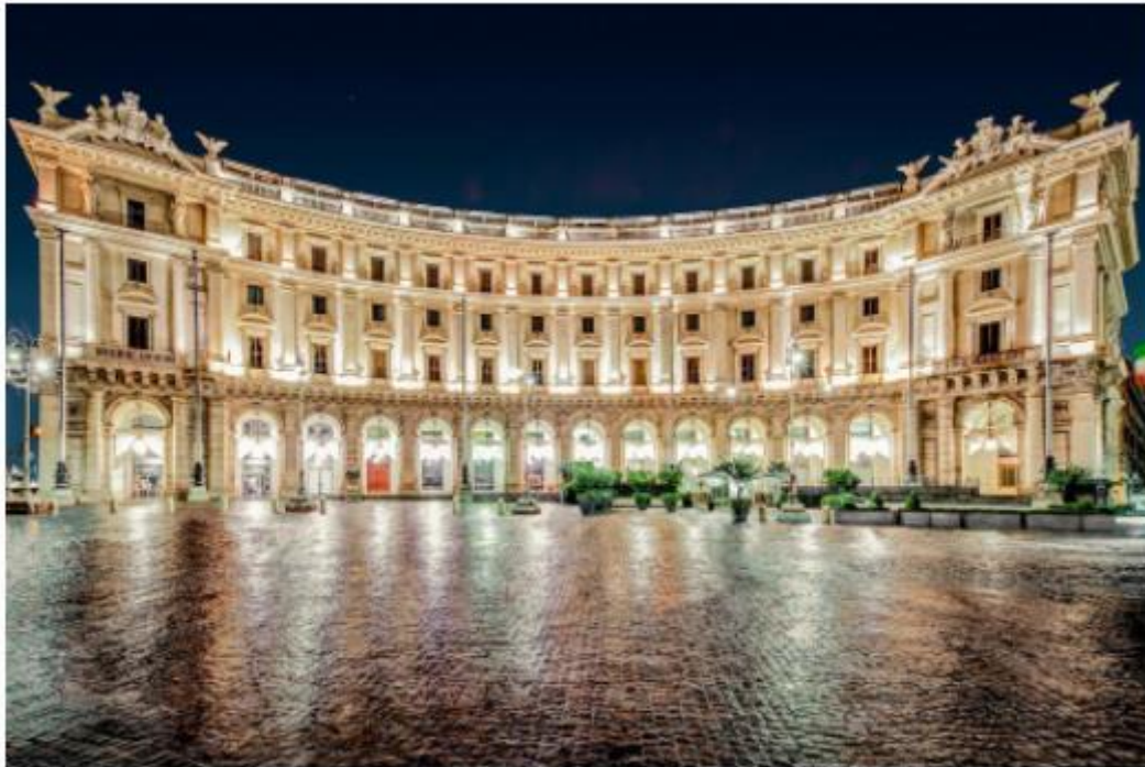
Exterior View of Anantara Palazzo Naidi Rome Hotel

The luxury global hospitality brand Anantara Hotels, Resorts & Spas announced its first property in Italy, the five-star Anantara Palazzo Naiadi Rome Hotel . A member of The Leading Hotels of the World , the iconic hotel is centrally located at the heart of Rome's Piazza della Repubblica.