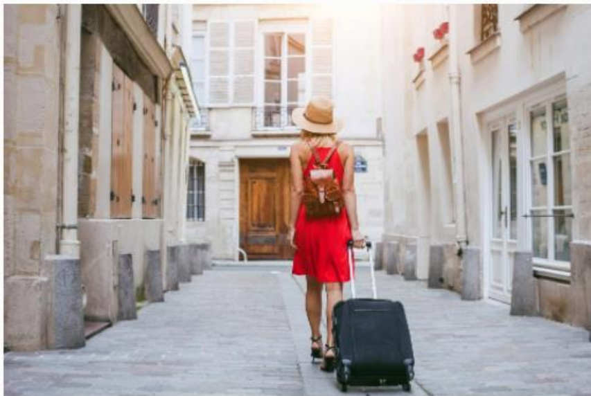
A number of new luxury hotels have recently opened in central Italy.

In the coming months, many pandemic-weary travelers will be planning visits to Italy. After a number of closures over the past two years, a spate of new luxury hotels have recently opened their doors or will be doing so in the near future.