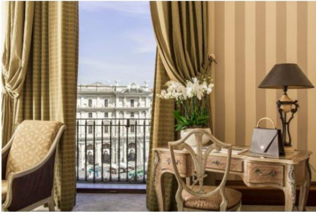
Living room of a Junior Suite Anantara Palazzo Naldi Rome ANANTARA PALAZZO NAIDI ROME

In addition to having one of the largest rooftop terraces in the city, the hotel has five unique indoor and alfresco dining venues. Since taking over the operation of the property, Anantara has been making a series of upgrades and refinements to this classic property, which recently provided a backdrop for House of Gucci with Lady Gaga and Adam Driver. A new Anantara Spa will launch on the top floor, and the hotel is developing a menu of bespoke Anantara experiences to introduce guests to the Eternal City.