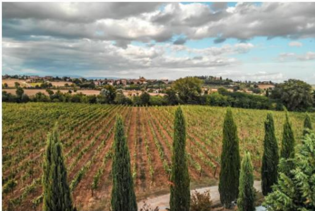
Driveway leading to Borgo San Vincenzo BORGO SAN VICENZO

It's not surprising that Borgo San Vincenzo , a luxury boutique hotel sited in a town associated with some of Italy's finest wines, is named after St. Vincent, the patron saint of winemaking.