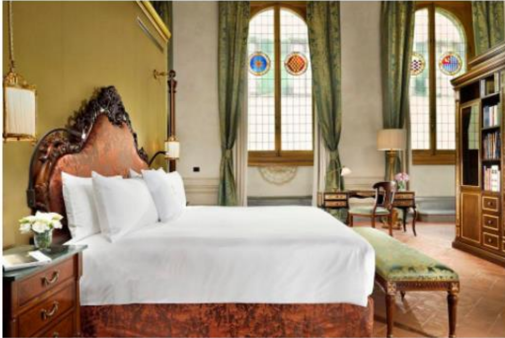
Elegant Guest Room at Palazzo Portinari Salviati

Now the palazzo has 13 classically-furnished suites, some with double bedrooms that have finely restored Renaissance fresco ceilings. The Royal Suite said to be one of the largest in Italy, occupying the entire main floor of the palazzo which includes its frescoed Gallery. The Salotto Portinari Bar & Bistro and the Chic Nonna restaurant, helmed by Chef Vito Mollica, offer locally-sourced gourmet dining. The property also has a gym and spa with a heated swimming pool.